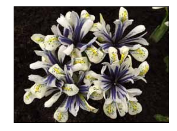
'Eye Catcher' with Multiple Flower Parts

I moved the bulb so we can see what happens next year. Conceivably a bulblet from that corner of the bulb may eventually yield a flower with yellow falls and standards, but with white style arms.