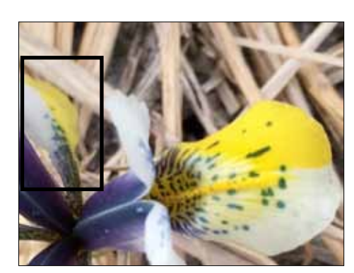
Eye Catcher with Yellow Fall