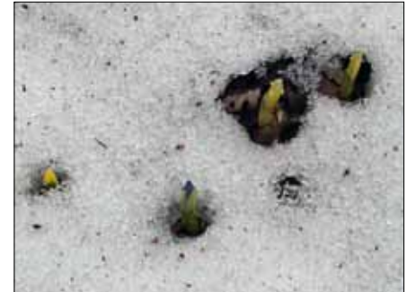
Retics coming up through Winter snow

I have been paying a lab in Holland to covert some of my hybrids from diploids to tetraploids (going from two to four sets of chromosomes). One of the benefits is the flowers should be 20-30% larger, and the petals should correspondingly be thicker and stand up even better to the weather. Does this mean the flowers will similarly last a little longer? That's something I'm looking forward to studying once I have some in my garden. In Holland I have seen that tetraploid 'Orange Glow' flowers are indeed 25% larger.