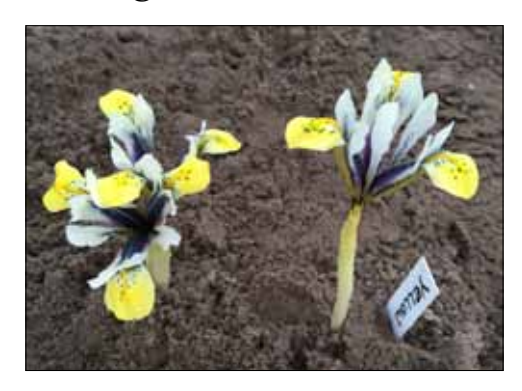
Yellow Eye Catcher

A previous Dutch grower of my 'Eye Catcher' had allowed 'Amazing' (00-KN-1) to be mixed in. In 2015 I spent about two days overall during the week I was there, going through the 150 m of 'Eye Catcher' and pulling out the 5-10% "contamination" and replanting it elsewhere. This year there was less than 1% and I was similarly looking over the bed (now 280 m) and taking out 'Amazing' and replanting them