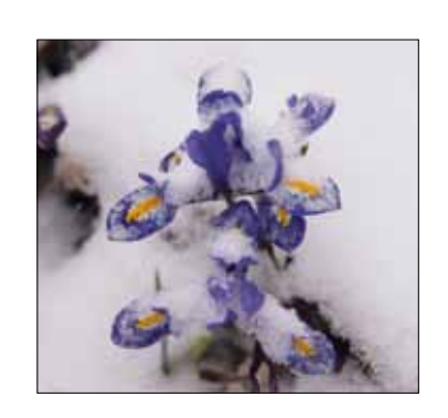
Fresh snow on blooming flowers

I have been paying a lab in Holland to covert some of my hybrids from diploids to tetraploids (going from two to four sets of chromosomes). One of the benefits is the flowers should be 20-30% larger, and the petals should correspondingly be thicker and stand up even better to the weather. Does this mean the flowers will similarly last a little longer? That's something I'm looking forward to studying once I have some in my garden. In Holland I have seen that tetraploid 'Orange Glow' flowers are indeed 25% larger.