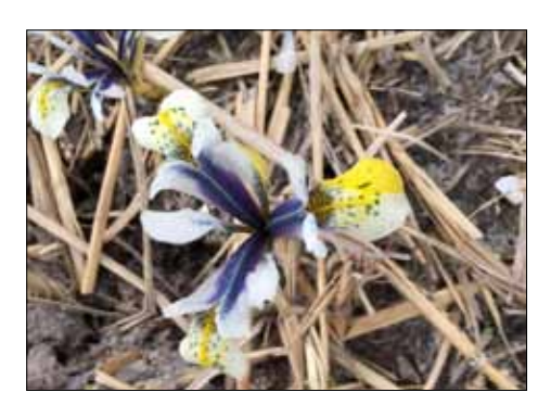
Eye Catcher in Straw